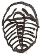
Naraoia Compacta Figure 1

For rockhounds of all ages, the Conasauga Formation is an easy dig, requiring a minimum amount of tools, and which yields many fossils from the Cambrian seas. However, the collector must exercise care when handling the fossils and must also remember to respect the dig site.