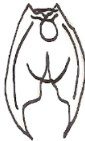
Unknown Fossil Figure 2